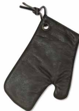
Vintage grey OG-V-VG