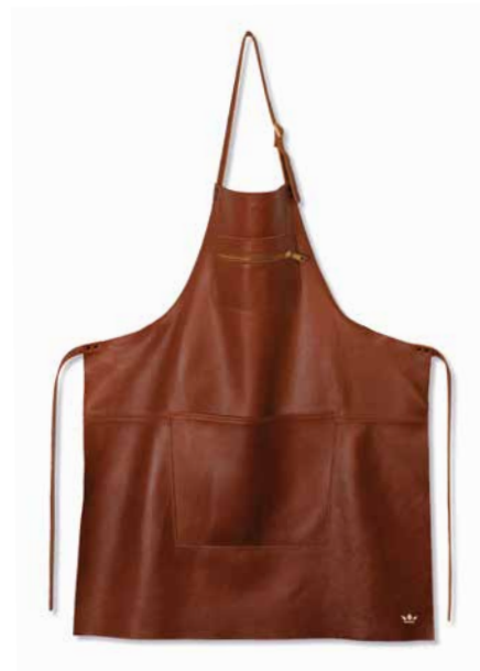
Classic brown AA-CL-CB