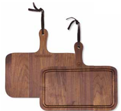
Solid walnut CBS-XS