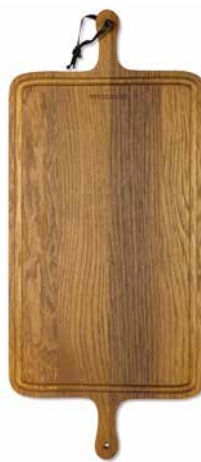
Solid smoked oak BBS-Q