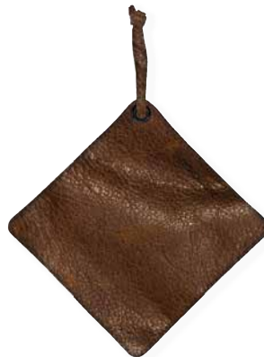
Vintage brown PH-L-VB