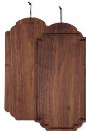
Solid walnut BBW-F*