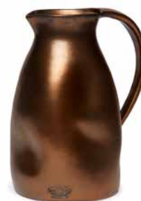
Platinum matt CAC-DJ-PM*