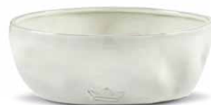
White, large BOC-DBL-W