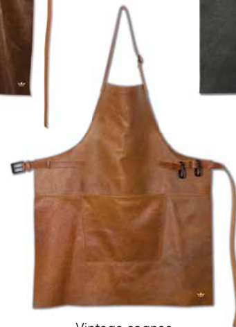
Vintage cognac AA-BS-VC