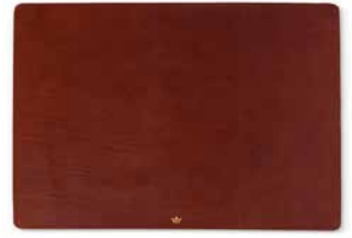
Classic brown PP-RE-CB