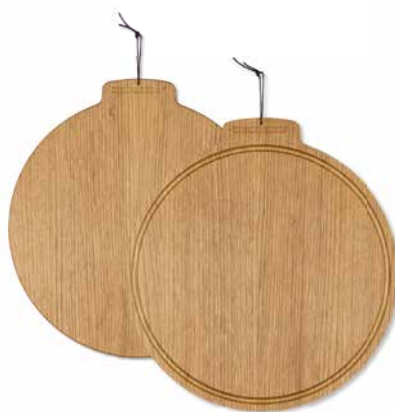
Solid oak BBO-M*

The Moon board has a classic round shape. This is perfect to serve breakfast or lunch and makes your table setting looks stunning.