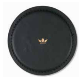
Classic black 4P-CC-BL

Our Coasters come in a set of 4 and measure Ø 10 cm.