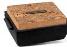
Black matt, small ODC-RS-BM