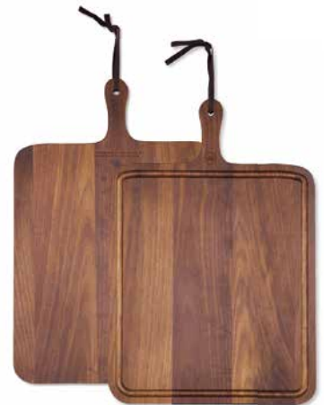
Solid walnut CBV