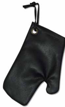
Classic black OG-U-BL