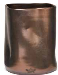
Platinum matt UHC-DC-PM*