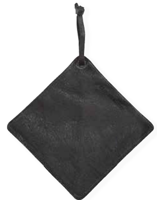
Vintage grey PH-L-VG