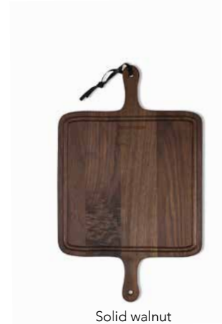
Solid walnut CBV-Q*