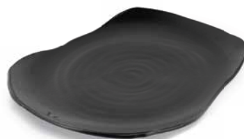
Black matt PC-XL-BM

Our Board plate XL measures 33,5 cm x 28 cm.