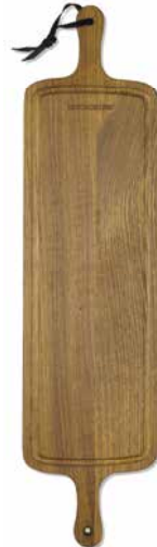
Solid smoked oak BBF-Q

The BBQ XL Slim fit is the perfect board for serving your homemade dishes. Prepare and present the dishes on the board. Easy to carry due to the handles on both sides.