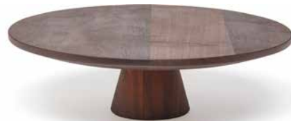
Solid walnut, large FSW-L*