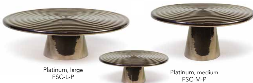
Platinum, large FSC-L-P