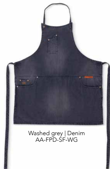
Washed grey | Denim AA-FPD-SF-WG