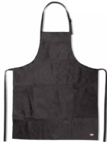
Vintage black AA-BR-VBL