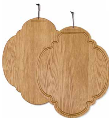
Solid oak BBO-O*