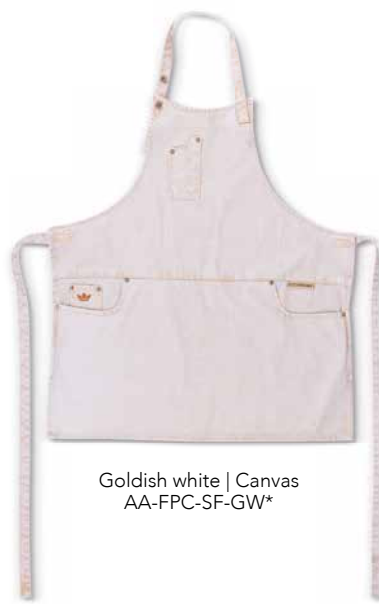
Goldish white | Canvas AA-FPC-SF-GW*