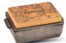
Platinum matt, small ODC-RS-PM*