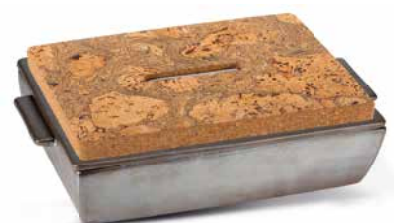
Platinum matt, large ODC-RL-PM*