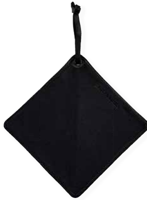
Classic black PH-L-BL