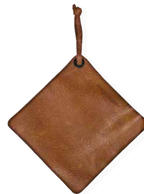
Vintage cognac PH-L-VC