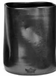
Black matt UHC-DC-BM

Our Dented crock measures Ø 14,5 x H 19 cm.