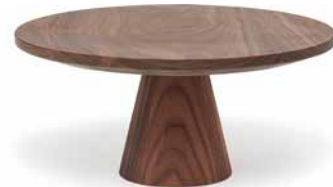
Solid walnut, medium FSW-M*