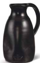
Black matt CAC-DJM-BM