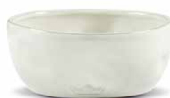
White, medium BOC-DBM-W