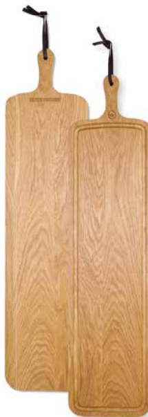
Solid oak BBF