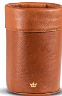
Classic brown WC-L-CB