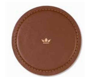
Classic brown 4P-CC-CB