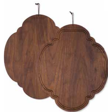
Solid walnut BBW-O*