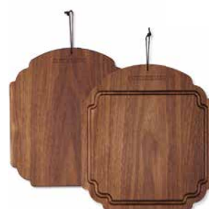
Solid walnut BBW-FXS*