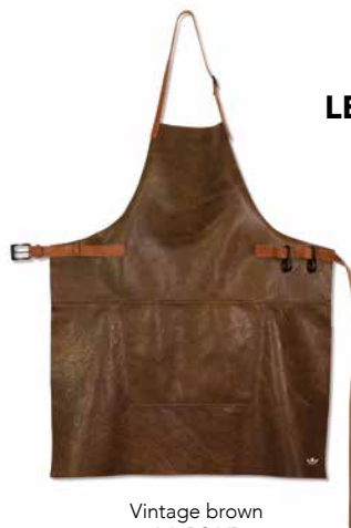
Vintage brown AA-BS-VB