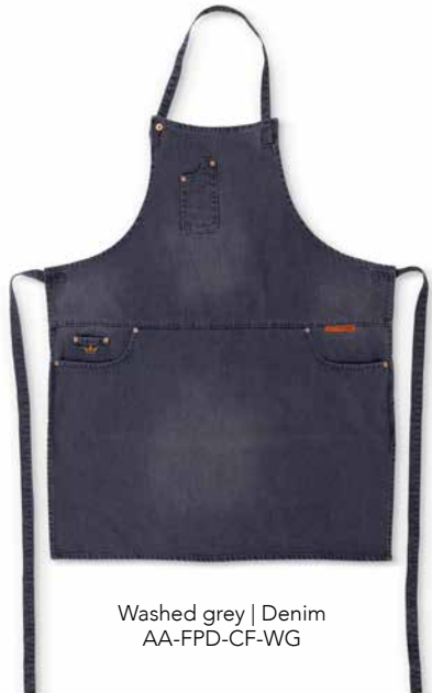
Washed grey | Denim AA-FPD-CF-WG