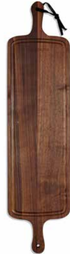
Solid walnut CBF-Q*