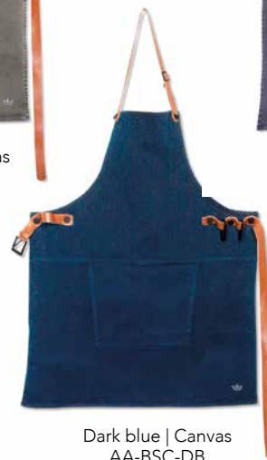
Dark blue | Canvas AA-BSC-DB