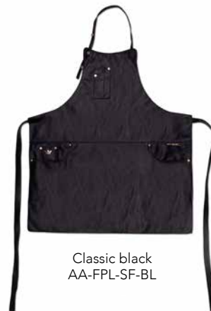
Classic black AA-FPL-SF-BL