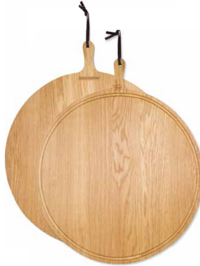
Solid oak BBR

The biggest solid wooden board, a real eye-catcher! Present different snacks on the XL Round; cheese, tapas or lunch. Use it as a chopping board or a beautiful serving tray.