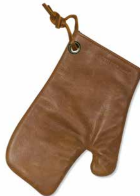
Vintage cognac OG-V-VC