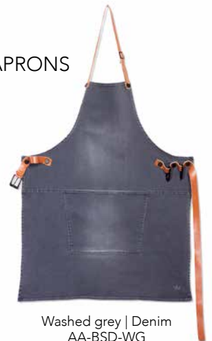
Washed grey | Denim AA-BSD-WG