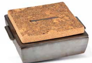
Platinum matt, medium ODC-RM-PM*