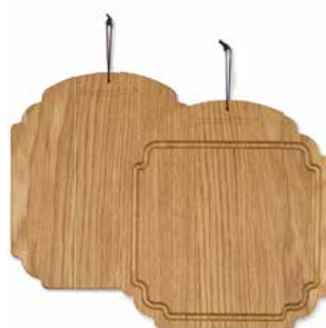
Solid oak BBO-FXS*

The board Frame XS has the perfect classic shape. It is perfect for small breakfast or lunch dishes, serve at the table or in bed!