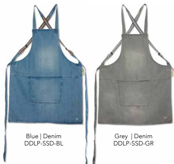
Blue | Denim DDL-P-SSD-BL