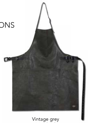
Vintage grey AA-BS-VG