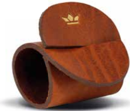
Vintage cognac NRR-L-VC