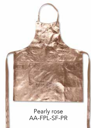
Pearly rose AA-FPL-SF-PR