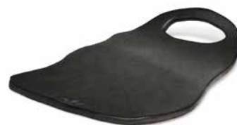
Black matt 4-BPC-T-BM