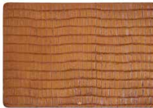
Vintage cognac PP-RE-VC*