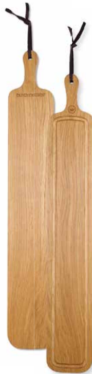
Solid oak BBST