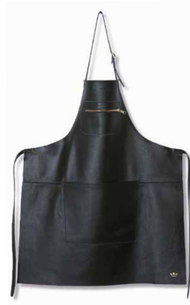
Classic black AA-CL-BL

The Zipper style aprons measure 67,4 x 78,5 cm (l x w).