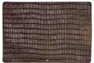
Vintage brown PP-RE-VB*