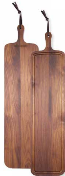
Solid walnut CBF