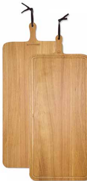
Solid oak BBS