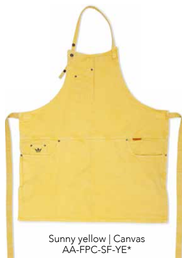
Sunny yellow | Canvas AA-FPC-SF-YE*

Our Five pockets slim fit aprons measure 67 x 66 cm (l x w).