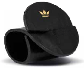
Vintage black NRR-L-VBL