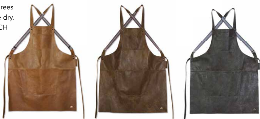
Vintage cognac DDL-P-SSL-VC