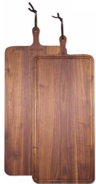
Solid walnut CBS