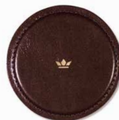
Metallic bronze 4P-CC-MB*