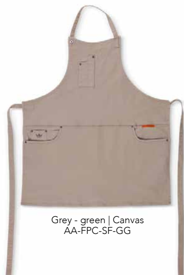
Grey - green | Canvas AA-FPC-SF-GG