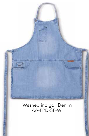
Washed indigo | Denim AA-FPD-SF-WI