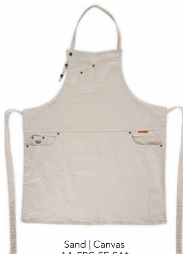
Sand | Canvas AA-FPC-SF-SA*