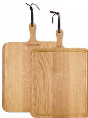
Solid oak BBV