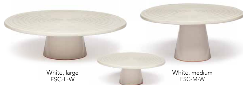
White, large FSC-L-W