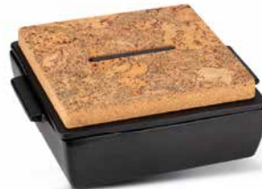
Black matt, medium ODC-RM-BM