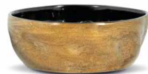
Platinum, large BOC-DBL-P