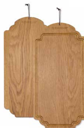
Solid oak BBO-F*