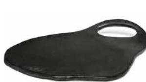
Black matt 4-BPC-L-BM