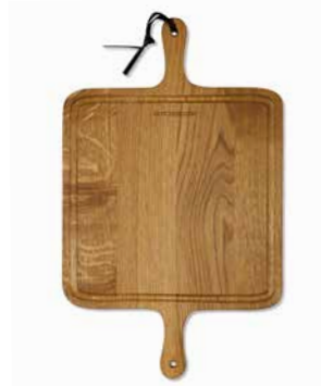
Solid smoked oak BBV-Q

The BBQ XL Square is the perfect board for a presenting your freshly grilled vegetables, seafood or meats from the grill. Easy to carry due to the handles on both sides.