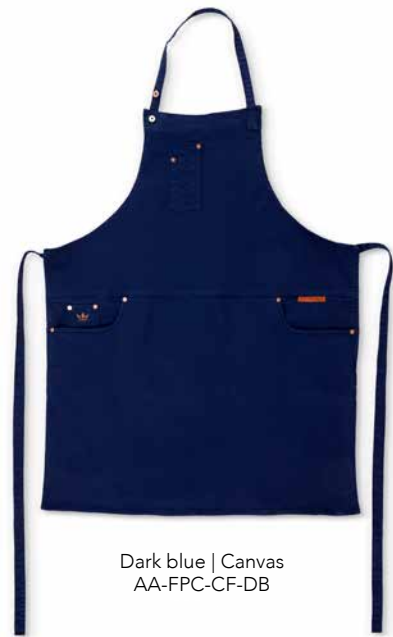
Dark blue | Canvas AA-FPC-CF-DB

Our Five pockets comfort fit aprons measure 85 x 69cm (l x w).