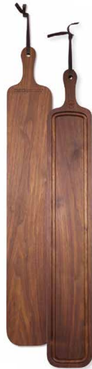
Solid walnut CBST