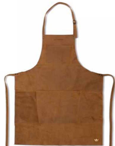
Vintage camel AA-BR-VCA