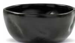
Black matt, medium BOC-DBM-BM