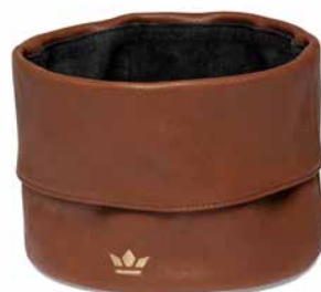
Vintage cognac 1-BB-B-VC

Our Bread baskets measure Ø 22 x H 15 cm.