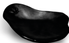
Black matt APC-SRC-BM

Our Spoon rest / Appetizer plate measures 15,5 x 20 cm.