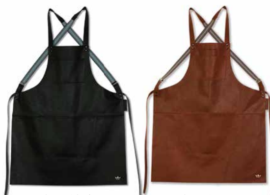
Classic black DDL-P-SSL-BL