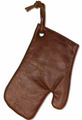
Classic brown OG-U-CB