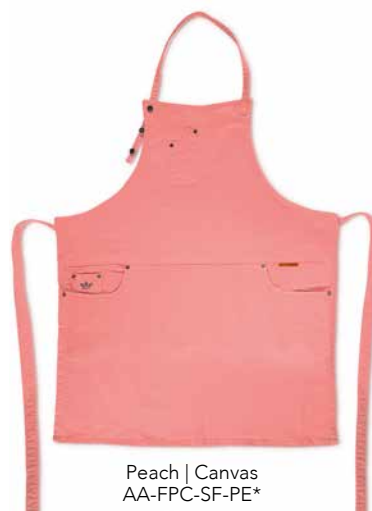
Peach | Canvas AA-FPC-SF-PE*