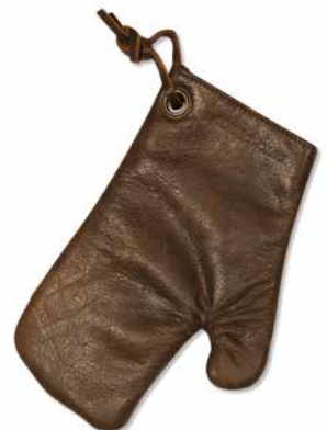
Vintage brown OG-V-VB