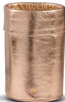
Pearly rose WC-L-PR