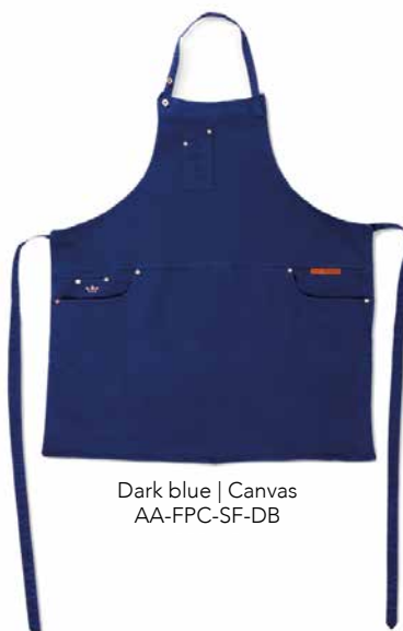
Dark blue | Canvas AA-FPC-SF-DB

Our Five pockets slim fit aprons measure 67 x 66 cm (l x w).