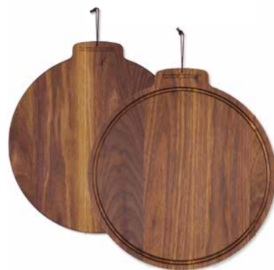
Solid walnut BBW-M*