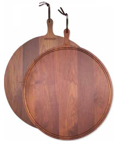
Solid walnut CBR