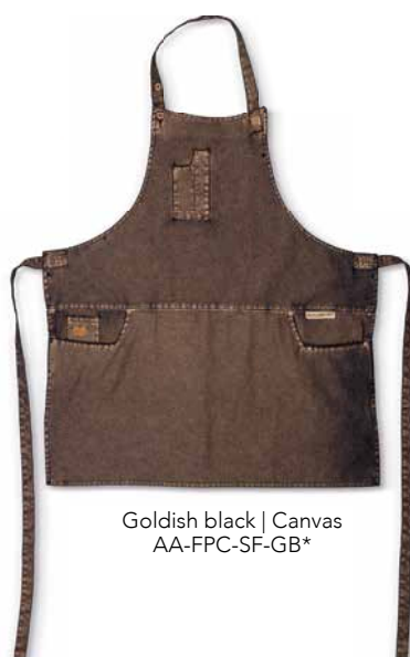
Goldish black | Canvas AA-FPC-SF-GB*