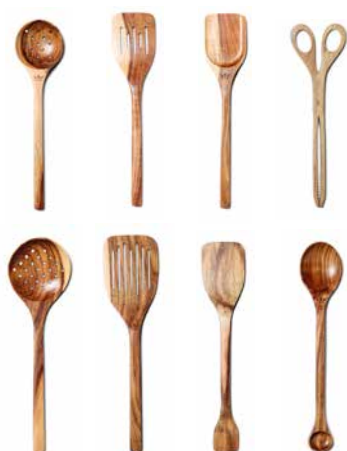
SET OF 8 WOODEN UTENSILS WUA-SET-8