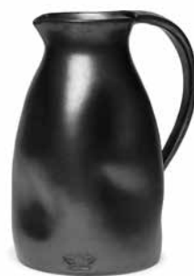
Black matt CAC-DJ-BM