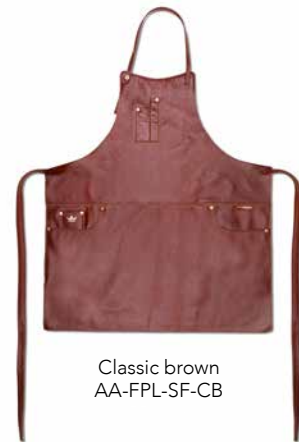
Classic brown AA-FPL-SF-CB