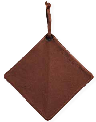
Classic brown PH-L-CB