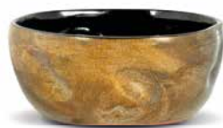
Platinum, medium BOC-DBM-P