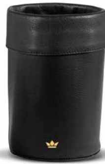
Classic black WC-L-BL