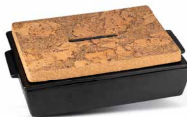
Black matt, large ODC-RL-BM