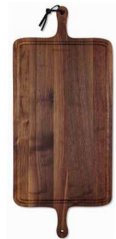
Solid walnut CBS-Q*