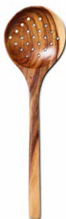
SKIMMER SPOON XL WUA-SK-SPO-XL