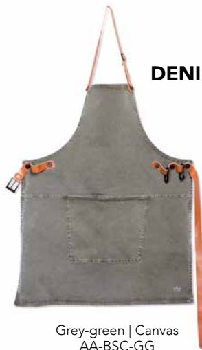
Grey-green | Canvas AA-BSC-GG