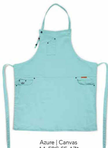
Azure | Canvas AA-FPC-SF-AZ*