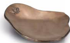
Platinum matt APC-SRC-PM*