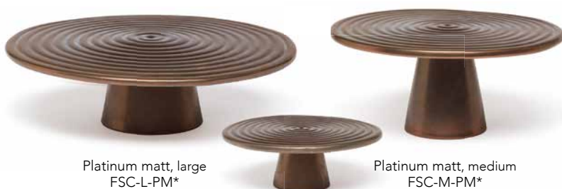
Platinum matt, large FSC-L-PM*