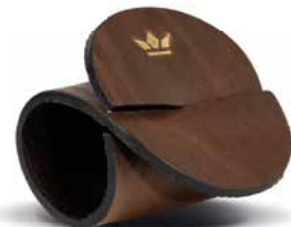
Vintage brown NRR-L-VB