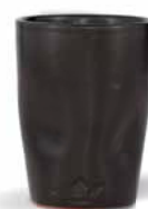
Black matt MUC-DM-BM