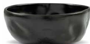
Black matt, large BOC-DBL-BM