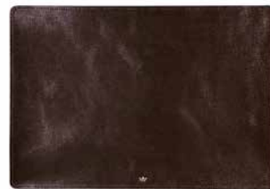
Metallic bronze PP-RE-MB*