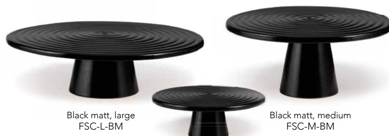
Black matt, large FSC-L-BM

Our ceramic Food stands measure: small Ø 20 x H 7 cm, medium Ø 25 x H 11 cm, large Ø 32 x H 9 cm.