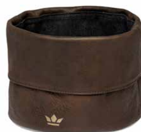
Vintage brown 1-BB-B-VB