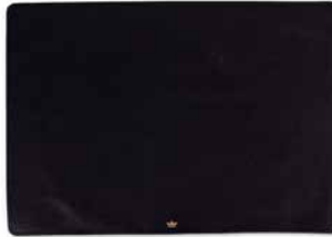
Classic black PP-RE-BL