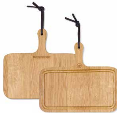
Solid oak BBS-XS

A wooden board with the perfect size for your breakfast, even to serve in bed. Or just for your club sandwich during lunchtime.