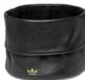
Vintage grey 1-BB-B-VG